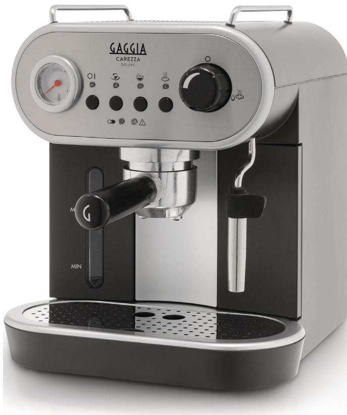
Gaggia Manual Espresso machine